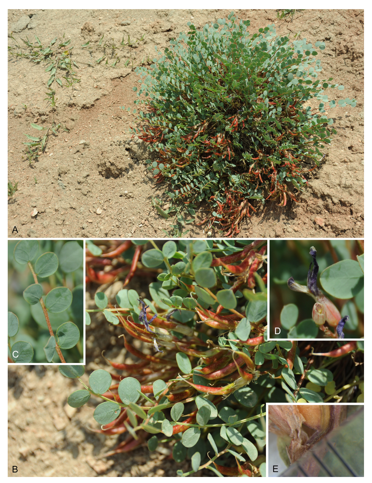
Fig. 1. Astragalus ihsancalisii – A: habit of fruiting plant; B: leaves and infructescences; C: part of leaf, adaxial surface; D: flowers, one truncated; E: stipe of legume. – Type locality, 26 June 2015, photographed by A. A. Dönmez.