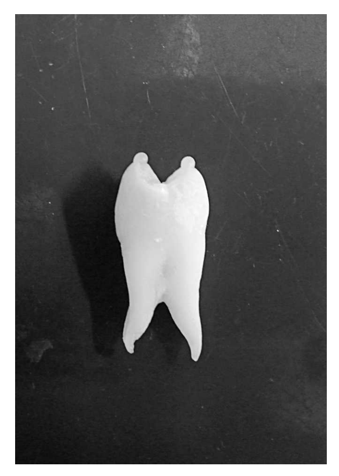
Figure 1. Specimen with reference points for intercuspal distance measurements.

Standardized large MOD cavities were prepared with boxes two-thirds the BPW of the tooth, and the occlusal isthmus was prepared to half of the BPW. The cavity depth at the occlusal isthmus was also standardized to 3.5 mm from the tip of the palatal cusp and 1 mm above the CEJ at the cervical aspect of the proximal boxes (Figure 3). The cavosurface