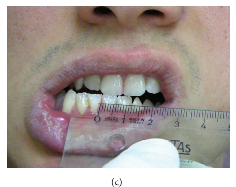
FIGURE 5: Lateral movement of both patients after treatment.

the follow-up appointments after 15 days, 1, 3, 6, and 12 months of the end of the treatment, to investigate effectiveness and cumulative effects. The MMO of the patient was increased gradually during the sessions. After the last application of the treatment MMO was increased to 45 mm (Figure 4), RE and LE were also increased to 8 mm (Figure 5), and he was painless during these limits of movement. There were no changes in the MMO in 1-year follow-up.