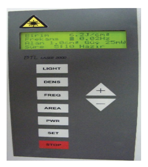
FIGURE 2: Laser device.

Laser Therapy Device) (Figure 2). The treatment protocol was decided according to the literature [6–9].