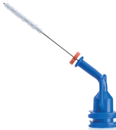
Fig. 1 NaviTip FX needle tip.

While activated using a smooth ultrasonic file (size #15 K-file, 0.02 taper) coupled to the file-holding adapter of a Satelec P5 Newtron XS ultrasonic system handpiece (Acteon Group, Merignac, France), 10 mL of 2.5% NaOCl was continuously delivered into the canal. The ultrasonic file was inserted into the 1 mm short of the WL without touching the walls, enabling it to vibrate freely. The irrigant was passively activated for 1.5 min at power setting 6 without engaging the file against the dentinal walls.