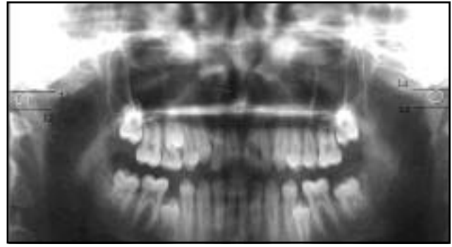
Figure 2 - The view of ROIs on left and right condyles on a panoramic radiograph. ROI - region of interest