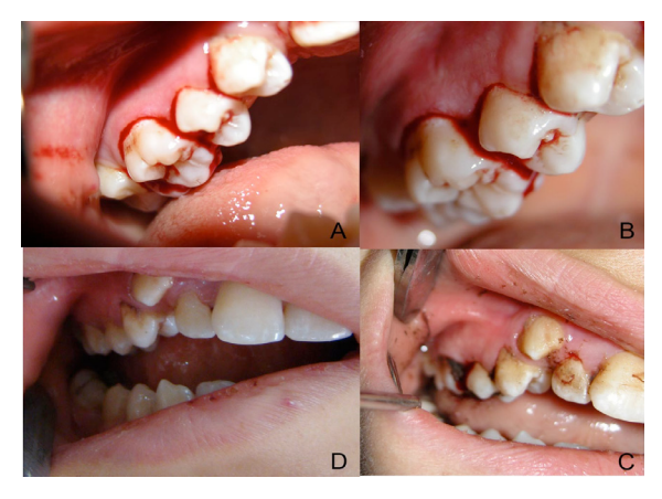
Figure 3. A: Spontaneous bleeding especially from interdental papilla region

ABS could be effectively used both in individuals with normal haemostatic parameters and in patients with deficient primary hemostasis and/or secondary hemostasis. The safety and efficacy of ABS in dental surgery and bleedings have been shown previously in 25 patients with normal hemostasis.<sup>18</sup> There was no statistically and clinically significant difference