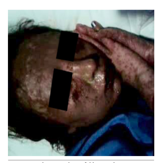
Figure 1: Blisters and painful hemorrhagic erosions on the skin.

and painful hemorrhagic erosions had appeared on her face, trunk, arms, and legs three days following initial symptoms. Diffuse hemorrhagic crusting bullous lesions had been seen [Figure 1]. After hospital admission, the clinical diagnosis of SJS was confirmed by a skin biopsy. Intensive care management was provided and an antiseptic paraffin impregnated gauze dressing containing 0.5 g chlorhexidine acetate per 100 g (BACTIGRAS)* was applied to the eroded areas. The patient was discharged from the hospital after 46 days with almost complete skin re-epithelization. Unfortunately, severe eye complications (xerophthalmia and bilateral blepharophimosis) developed.