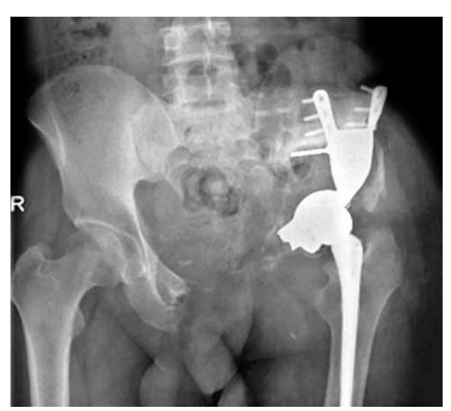
Figure 4. Two-year follow-up after the implantation of the custom-made prosthesis. There is no radiographic sign of implant loosening. The patient has good functional score with negative results for serologic markers.

(Figure 3a and b). The final implant allowed rigid screw fixation of the implant to the remaining pelvis. Hydroxyapatite coating was applied to the areas where bone contact was planned.