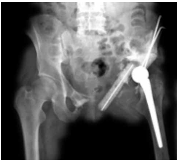
Figure 2. Subsequent to implant removal and serial debridements, antibiotic-impregnated poly methyl methacrylate spacers were implanted due to deep infection at four-year follow-up.

The achievement of allograft-bone union was seen at one-year follow-up. After four years without any complaint and with good functionality, a purulent drainage started from the incision. Erythrocyte sedimentation rate and C reactive protein levels were also elevated. Allograft resorption was detected upon radiographic examination. Following the initial debridement and implant removal, an antibiotic-loaded poly methyl methacrylate spacer was implanted (Figure 2). Femoral component was retained because the infection was limited around allograft and acetabular component, and also there was no radiographic or intraoperative evidence for femoral component loosening. Klebsiella pneumoniae that is sensitive to cefazolin and gentamicin was isolated in deep cultures. Multiple debridements, spacer exchange and supplementary negative pressure wound therapy were utilized for eradication