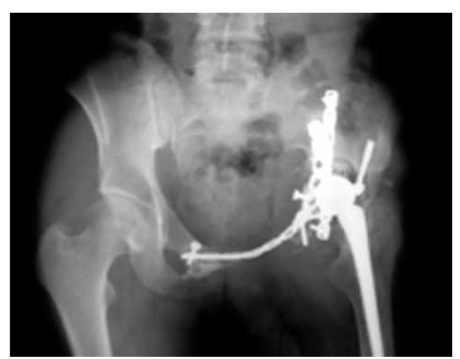
Figure 1. Postoperative X-ray after type II-III resection and reconstruction with a pelvic allograft.

The achievement of allograft-bone union was seen at one-year follow-up. After four years without any complaint and with good functionality, a purulent drainage started from the incision. Erythrocyte sedimentation rate and C reactive protein levels were also elevated. Allograft resorption was detected upon radiographic examination. Following the initial debridement and implant removal, an antibiotic-loaded poly methyl methacrylate spacer was implanted (Figure 2). Femoral component was retained because the infection was limited around allograft and acetabular component, and also there was no radiographic or intraoperative evidence for femoral component loosening. Klebsiella pneumoniae that is sensitive to cefazolin and gentamicin was isolated in deep cultures. Multiple debridements, spacer exchange and supplementary negative pressure wound therapy were utilized for eradication