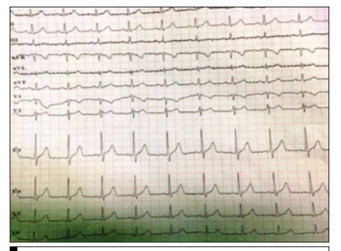
Figure 1. Preoperative electrocardiography

In 2001, Gussak et al. (3) described minor and major criteria for the diagnosis of Brugada syndrome (Table 1). Minor and major criteria are considered to be enough for the diagnosis. Our patient's ECG revealed saddleback ST segment elevations that was lower than 1 mm in the right precordial leads. He had a normal ECO but a family history of sudden cardiac death. Therefore, he was diagnosed with Brugada syndrome type 3.