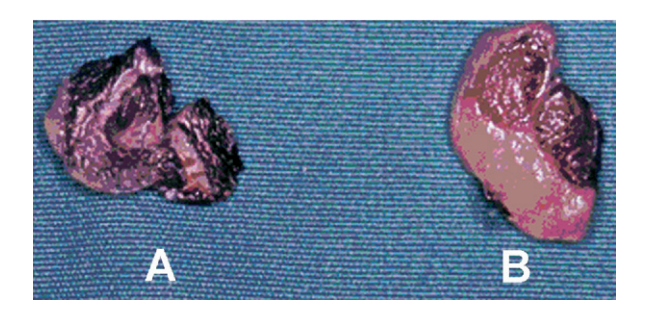
Fig 1. The appearance of gastrocnemius muscles stained with nitroblue tetrazolium dye just before planimetry. A, Viable muscle stained dark, and (B) nonviable muscle remained pale and unstained.

tissue of each muscle slice was determined by the amount of necrosis in each muscle and was expressed as a percentage. Percentage of necrosis = (total unstained area/ total area) \times 100.