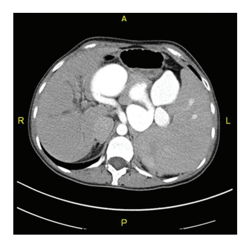
FIGURE 1: Computerized Tomography (CT) scan shows multiple aneurysms along splenic artery.