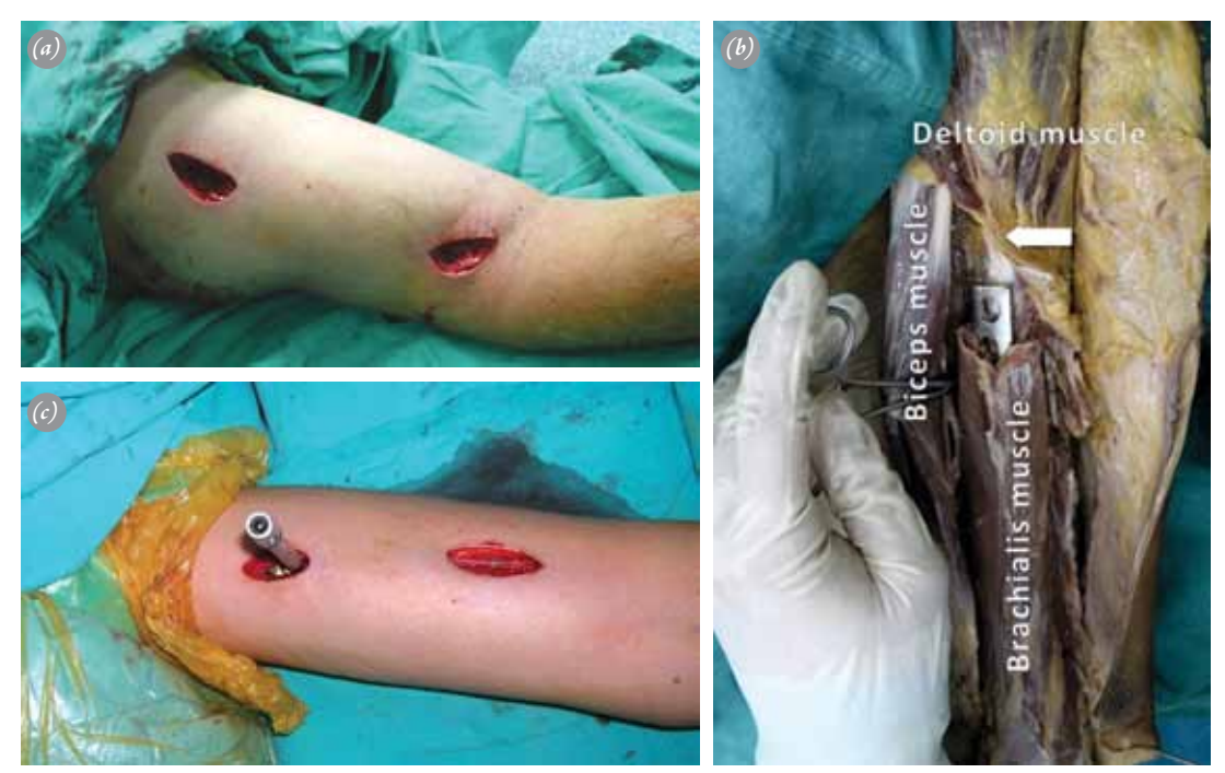
Fig. 1. (a) Proximal and distal incisions for MIPPO. (b) The brachialis muscle covering distal half of the anterior humeral surface, through which the plate is advanced and the detached anterior deltoid insertion (white arrow), to facilitate both plate advancement and positioning. (Cadaver dissection). (c) The threaded drill guide is engaged to the lock-ing plate to help positioning. [Color figure can be viewed in the online issue, which is available at www.aott.org.tr]

In all cases, acceptable alignments were maintained by reducing the main fragments. All fractures had successful union without deep infection or wound complication (Fig. 2). Two patients had superficial wound infections which were controlled with antibiotic therapy. One