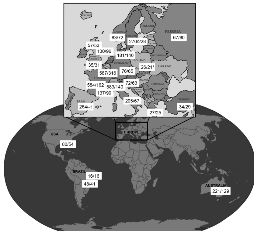
Figure 1. Study characteristics (number of isolates/patients screened) from 22 centers in 19 countries participating in a study of azole resistance in Aspergillus fumigatus . *Period screened was 8 months instead of 1 year in this center for unknown reason. †Total number of screened patients is unknown because this center is a reference laboratory that does not have access to patient characteristics.

on Antimicrobial Susceptibility Testing) broth microdilution reference method (6), and determination of the full coding sequence of both strands of the cyp51A gene and the promoter region by PCR amplification. For every resistant isolate, a susceptible control isolate was assigned; this control isolate was the first susceptible isolate screened on the 4-well plate format in the same center after the resistant isolate, and they received molecular species identification and susceptibility testing according to the EUCAST broth microdilution reference method (6).