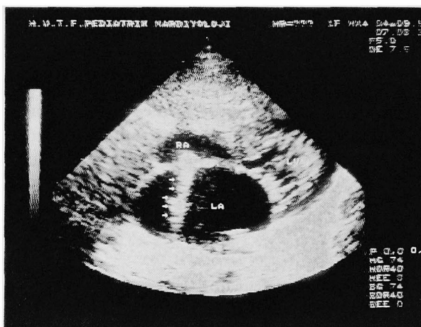
Fig. 1. Subcostal echocardiogram. The tip of the blade catheter introduced from the right atrium into the left atrium through the interatrial communication is seen as a dense image (arrows). RA=right atrium; LA=left atrium; LV=left ventricle; RV=right ventricle.

The 6 F catheter with a sheath was inserted into the femoral vein under fluoroscopy. The catheter entered the right atrium. Then a 5 MHz echo transducer was placed over the subcostal region. The tip of the catheter and foramen ovale or atrial septal defect were visualized. With manipulation, the catheter entered the left atrium through the interatrial communication. The sheath was then left in the left atrium. The inside catheter was replaced with the blade catheter. The tip of the blade catheter was denser than the other parts echocardiographically (Fig. 1). The blade was extended by ad-