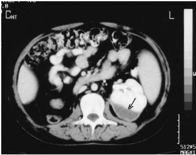
Figure 1. Developed peri-renal haematoma (arrow) around the left kidney of the patient due to PAN.