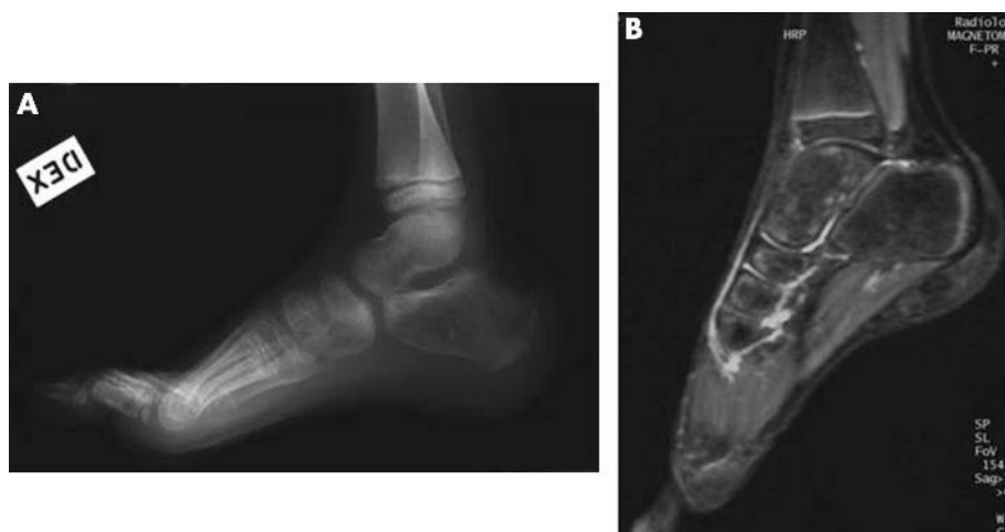
Figure 1 A radiograph showing marked osteoporosis in the tarsal and metatarsal bones. In the MRI scan, hyperintensity in the tarsal bones can be seen as a sign of oedema in T 2 weighted images.

The treatment of TBMO is not well established. Core decompression and vasodilator treatment with iloprost have been suggested. 4,7 Conservative treatment aims at protecting bone from weight bearing, both to prevent collapse of the articular surface and provide relief from pain. In this