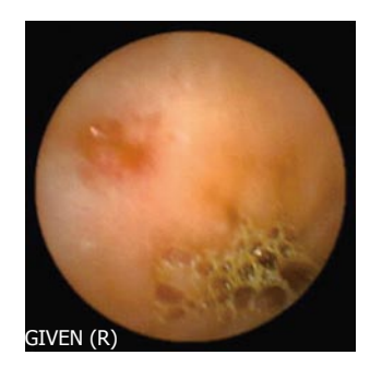
Figure 4 Punched-out ulcer in Behcet's disease.