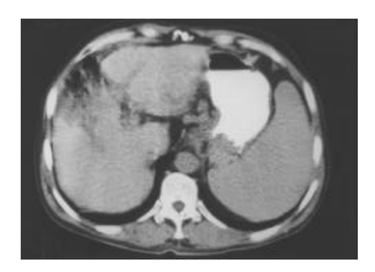
Figure 1 CT image of the lesion in the liver.

Computed tomography (CT) of the patient's head revealed multiple intracranial masses and homogenous enhancement by post-contrast CT (Figure 1).