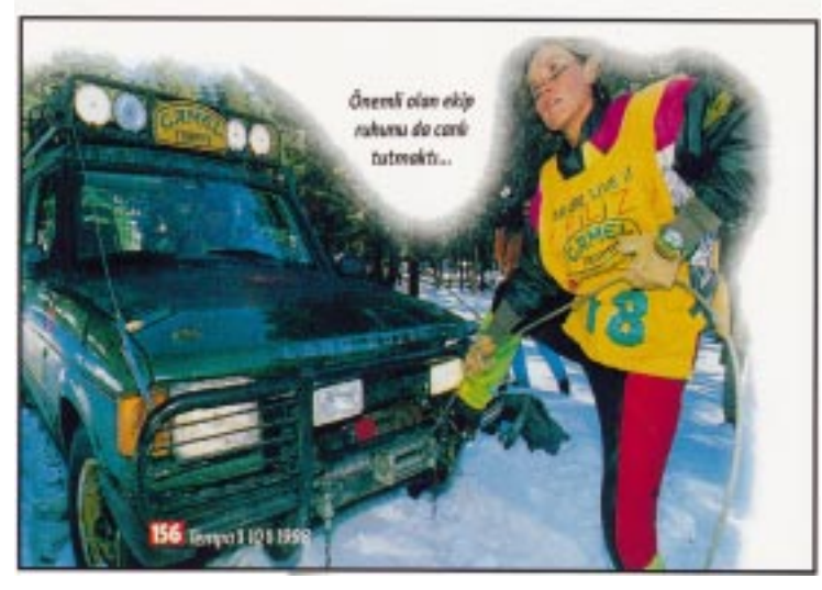
Figure 3 Indirect advertising appearing after the ban on tobacco advertising, in the form of news stories about the Marlboro-sponsored Turkish rally team and the Camel Adventure Tour.

The total mean scores for recognition of all brand names and logos differed significantly by sex (11.2 for boys vs 10.4 for girls, F = 11.83, p<0.001). Brand recognition ranged from 58.1% for Chee-tos (a food) to 95.2% for Samsun (a domestic cigarette brand) (table 2). Recognition rates for cigarette brand names and logos were 95.2% and 80.8%, respectively, for Samsun; 84.0% and 90.5%, respectively, for Camel; and 92.1% and 69.5%, respectively, for Marlboro. The Camel logo and the Samsun and Marlboro brand names were the most highly recognised of all product logos and brand names tested (table 2).