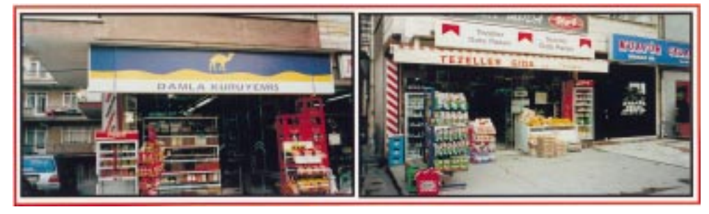
Figure 2 Store front signs for Camel and Marlboro cigarettes displayed after adoption of legislation in 1996 banning tobacco advertising and promotion.

There was no significant difference in smoking behaviour between children whose parents smoked domestic cigarettes and those whose parents smoked foreign brands ( \chi^2 = 3.79, p>0.05). Of the 118 ever-smoking children, 89 (75.4%) were against their parents' smoking.