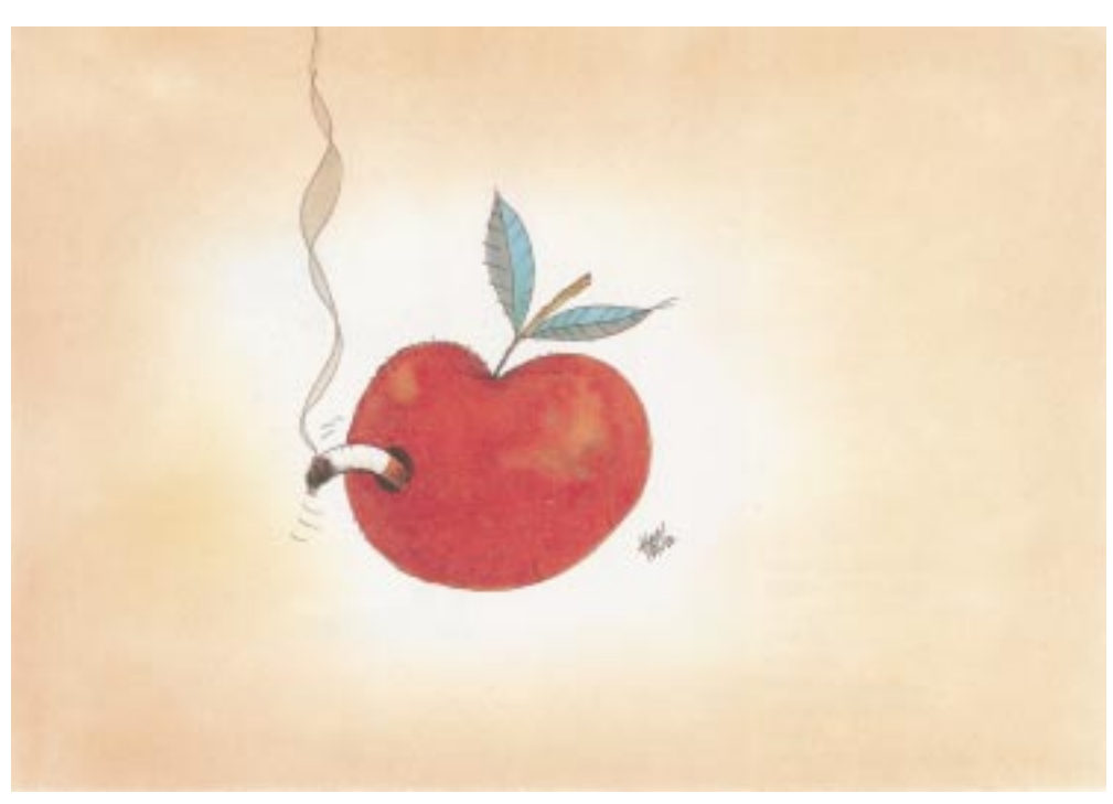
By Kâmil Yavuz (Turkey).