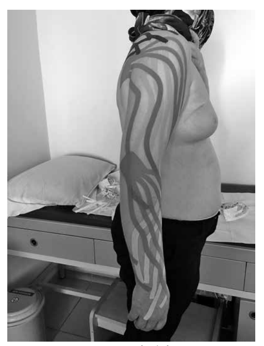
Figure 17. Kinesio-taping for left upper extremity breast cancer-related lymphedema.

There is no special diet for the management of lymphedema. The only condition on which diet has