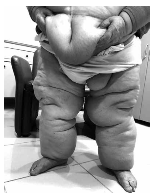
Figure 2. Severe lipedema associated with obesity (note the skin folds at the ankles and skin texture of orange peel with large dimples).

Lymphedema occurs not only in a pure form, but also in combination with lipedema (Figure 2), obesity and chronic venous insufficiency. Malignant lymphedema (impairment and blockage of lymph drainage caused by direct tumor infiltration and/ or lymph node metastases) (Figure 3), inflammatory conditions, chronic venous insufficiency (brown pigmentation at distal foot, eczema-like skin changes), deep venous thrombosis (DVT), hypoalbuminemia, inflammatory rheumatic disease, heart failure, renal insufficiency, drug-induced edema