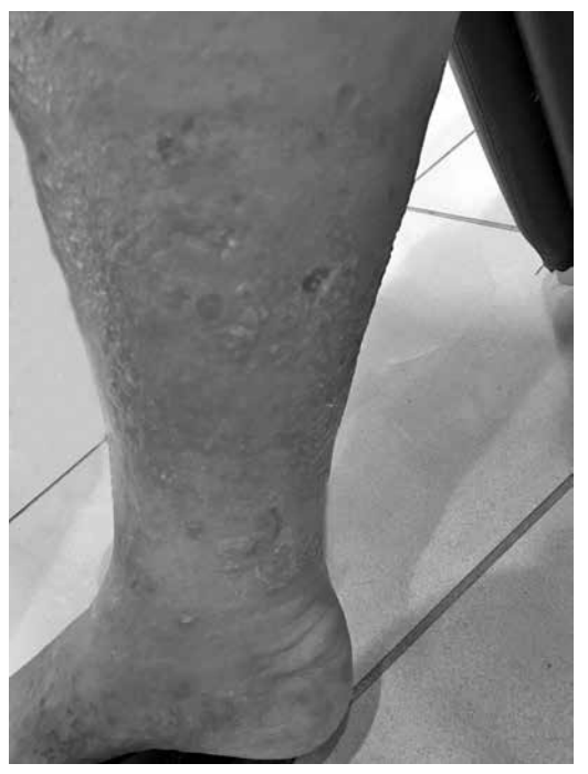
Figure 7. Lymph cysts and lymphorrhea in the right lower extremity of a morbid obese patient with bilateral phlebo lymphedema.