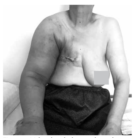
Figure 3. Malign lymphedema with rapid onset, fullness of supraclavicular fossa, more proximal/ central location and cyanotic skin developed in a patient with right breast cancer surgery.

(i.e., chemotherapeutics, corticosteroids, hormones, antihypertensives, antivirals, non-steroidal antiinflammatory drugs [NSAIDs]), lipedema (foot are spared, Stemmer sign negative) (Figure 4) have to be suggested in the differential diagnosis of lymphedema. Diagnostic laboratory tests (kidney, liver thyroid functions, D-dimer), chest X-ray, electrocardiography, echocardiogram, venous Doppler ultrasonography (US), magnetic resonance imaging (MRI), or computed tomography (CT) can be performed for the diagnosis of edema.<sup>[8,9]</sup>