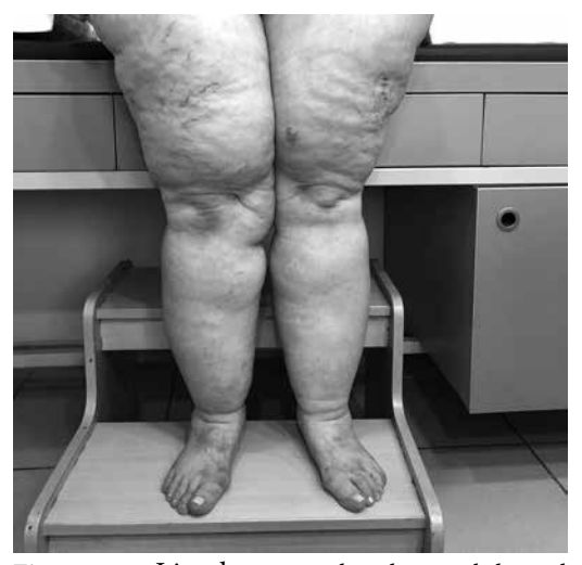
Figure 4. Lipedema with always bilateral involvement and sparing of the feet.