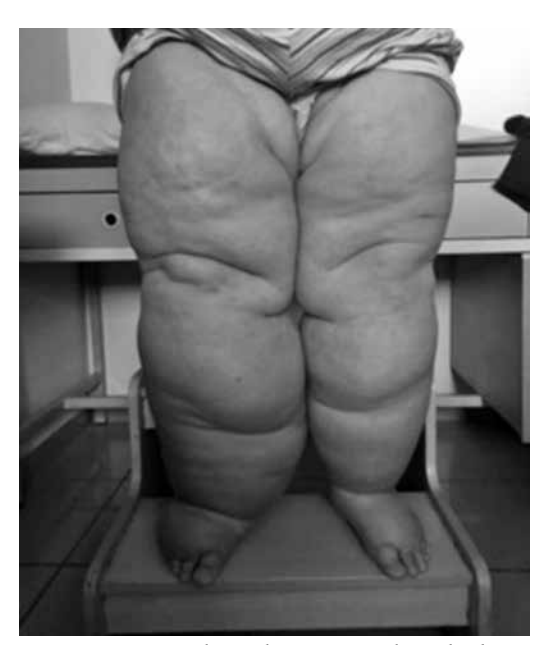
Figure 10. Bilateral severe lymphedema (elephantiasis) in the lower extremity of a patient with endometrium cancer-related surgery.

Stage 3: Results in lymphostatic elephantiasis with extreme increase in volume and typical skin changes