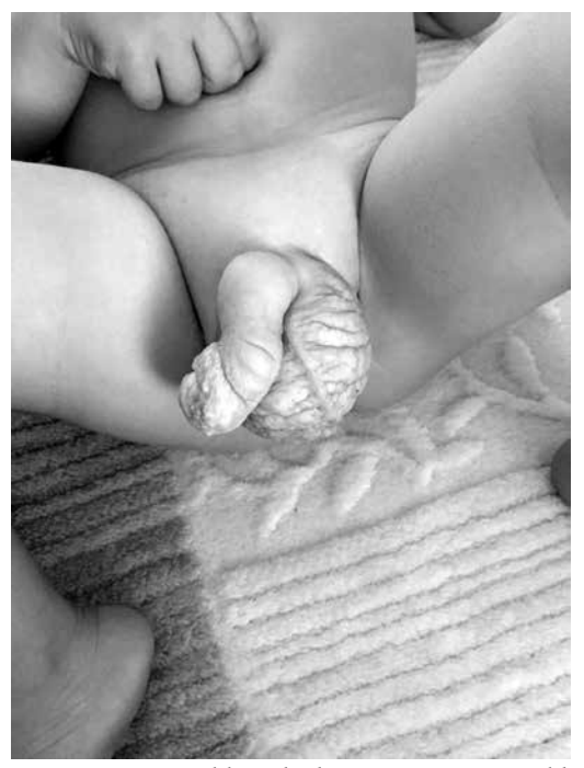
Figure 13. Genital lymphedema in a two-year old boy.