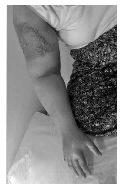
Figure 11. Stewart Treves syndrome in a patient with breast cancer-related lymphedema.

Patients with locally advanced head and neck cancer and/or cancer surgery are at risk of head and neck lymphedema (HNL). Progressive lymphedema