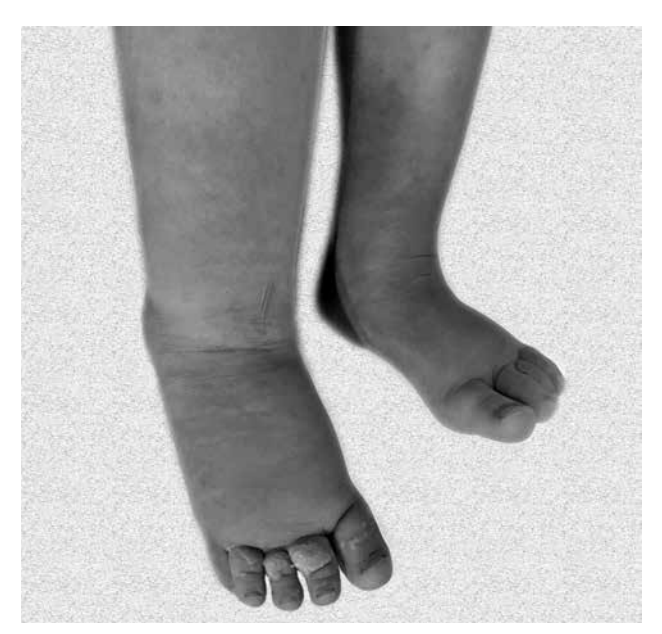
Figure 6. Papilloma on the dorsum of the right toes developed in a pediatric patient with congenital lymphedema.

Complete neurological examination consisting muscle strength, sensation and deep tendon reflexes should be performed for the differential diagnosis of radiation plexopathy, entrapment neuropathy, or other neurological and metabolic diseases. Examination of sensation is important for compression therapies, as skin complications may develop in neuropathic conditions.<sup>[8-11]</sup>