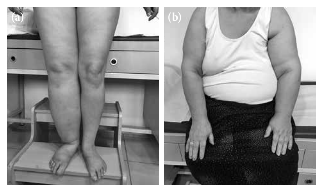
Figure 1. (a) Lymphedema in right lower extremity. (b) Lymphedema in left upper arm.

cancers comprising breast, endometrium, cervix, ovary, melanoma, prostate, and bladder. The rate of breast cancer-related lymphedema (BCRL) has been estimated as 7 to 28% in small-scale studies conducted in Turkey.<sup>[5]</sup> In addition, the incidence of lower limb lymphedema related with cancer therapies is reported to be over 70% in some previous reports.<sup>[6]</sup> Although the true incidence of primary lymphedema is not clear, it is estimated to be 5 to 10% with slightly higher in females.<sup>[1,4]</sup>