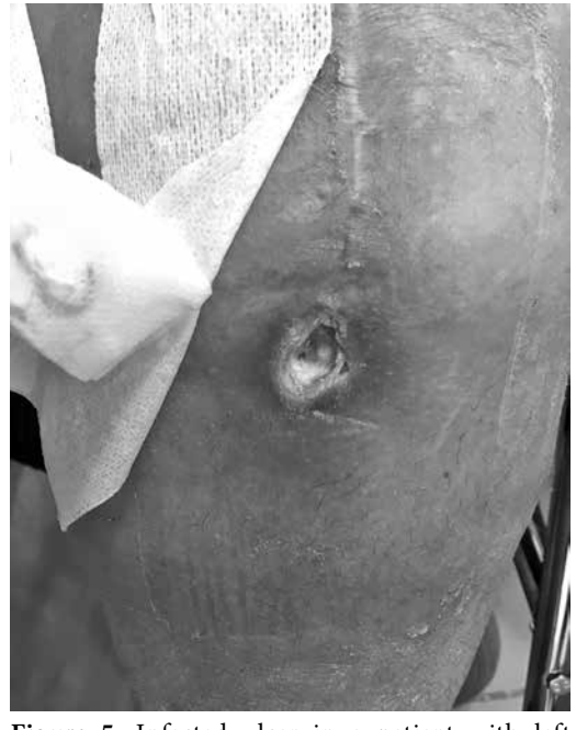
Figure 5. Infected ulcer in a patient with left lower extremity lymphedema developed after knee replacement surgery.

The posture, asymmetry, obesity, localization, and size of lymphedema, skin changes (skin color, ulcer