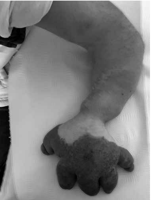
Figure 15. Congenital lymphedema in the right extremity and abdomen in a one-year-old girl.