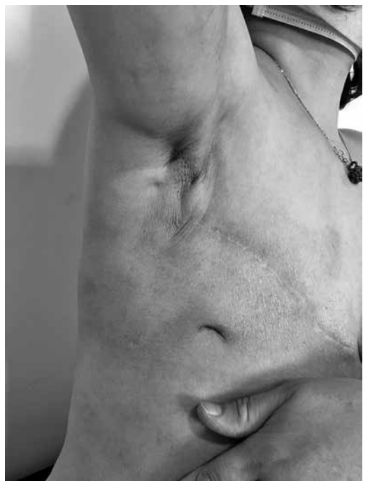
Figure 12. Axillary web syndrome developed after breast cancer surgery.