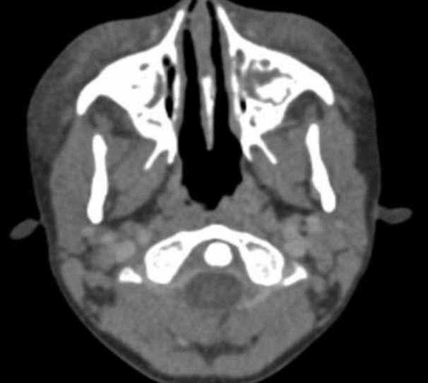
Figure 1. Paranasal computed tomography of the child showing extensive bilateral opacification and new bone formation within the maxillary sinuses with sclerosis, thickening of sinus walls.