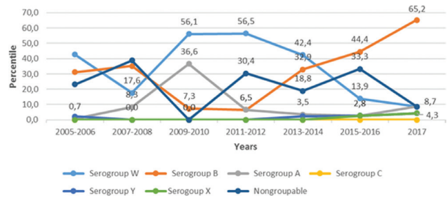
Disclosures. All authors: No reported disclosures.