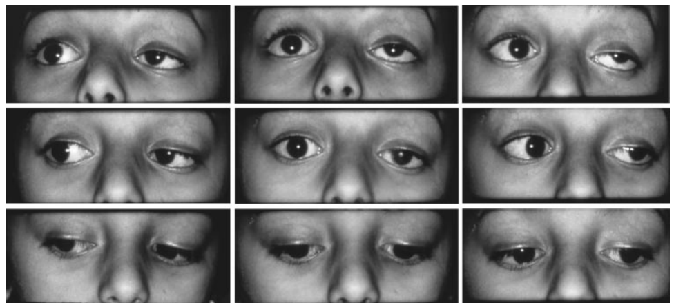
FIGURE 2. Photographs of an affected member of pedigree BE after ptosis surgery with eyes in primary position (center) and eight fields of gaze. Note the participant's ability to raise both eyes slightly above the midline. Her chin-up face position improved significantly after correction of the ptosis. Similarly, other affected family members' chin-up position also seemed to correlate best with their degree of ptosis, suggesting that their primary globe positions were nearly neutral. Horizontal and down gaze were relatively full.

Pedigree BW is a large Turkish family whose CFEOM phenotype was strikingly different from the CFEOM1 pedigrees we